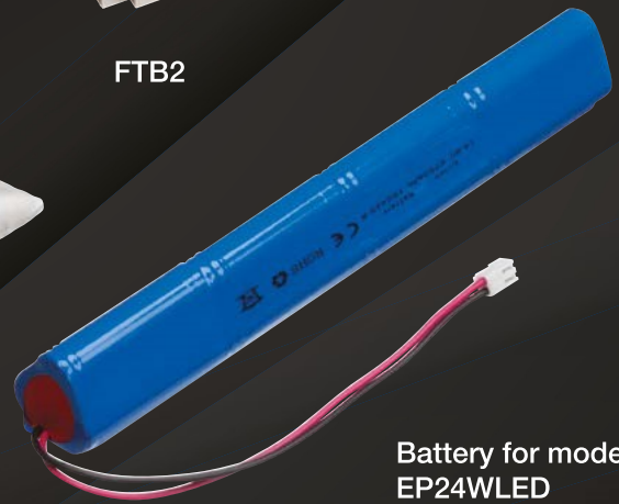
Battery for model EP24WLED