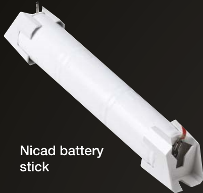
Nicad battery stick