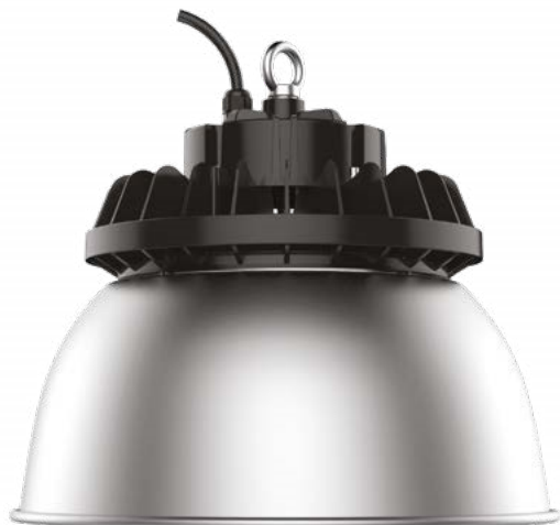
150W with reflector