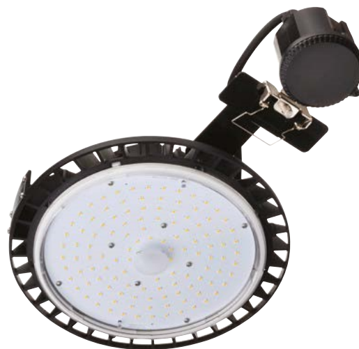
150W with sensor