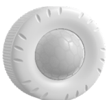
Plug in PIR