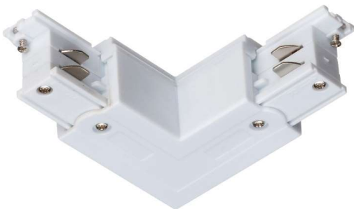
CLTSLWH (Track L Piece Joiner)