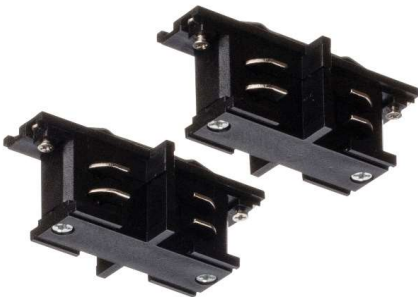
CLTSMIBK (Track Joiner)

1mtr length of White Track 3mtr length of White Track