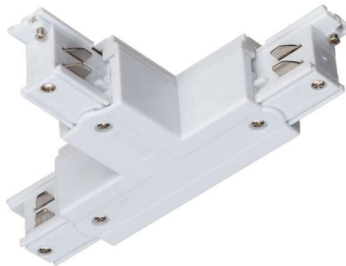
CLTSTWH (Track T Piece Joiner)