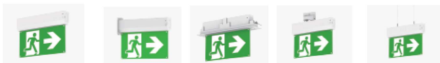
Ceiling / Wall Mounting Side Mounting Recessed Mounting Track Mounting Pendant Mounting